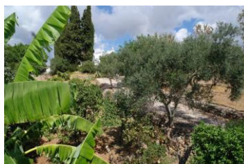
The path to the practice room from Casa Japonica - fig, orange, banana & pomegranate growing in the orchard

If you require any further details you can contact Gillian on 01527 857586 or email girus3@btinternet.com